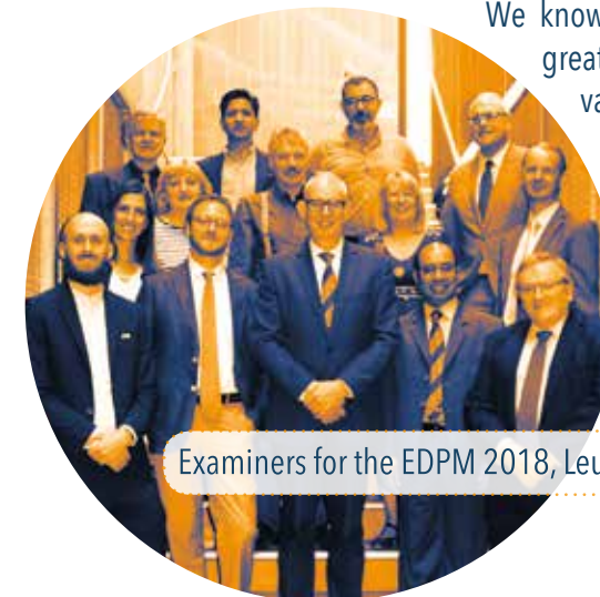
Examiners for the EDPM 2018, Leuven

We know this is an ambitious programme, but we believe there is great value in each of these projects, and that progress is achievable within a 3-year timespan with hard-working project leaders.