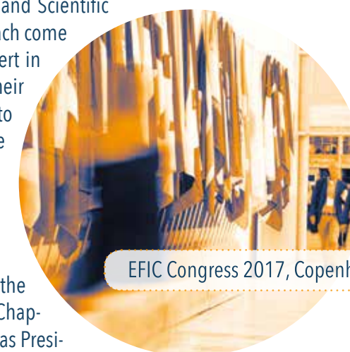
EFIC Congress 2017, Copenhagen