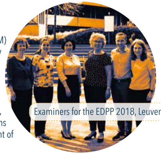
Examiners for the EDPP 2018, Leuven