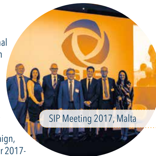
SIP Meeting 2017, Malta