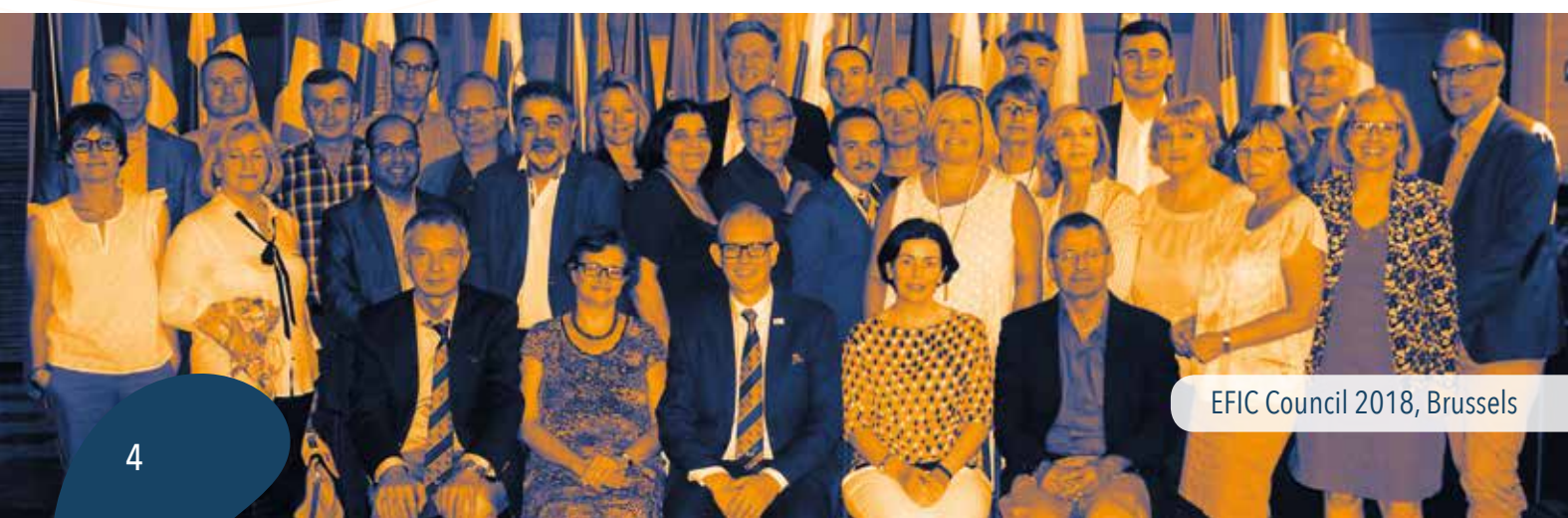
EFIC Council 2018, Brussels