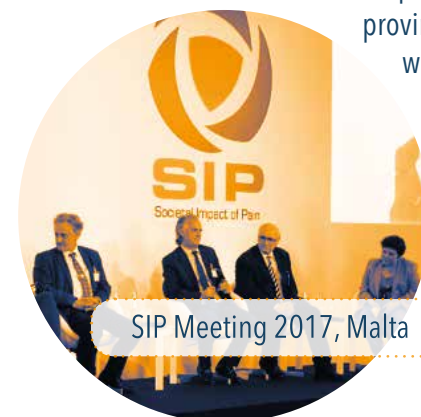
SIP Meeting 2017, Malta