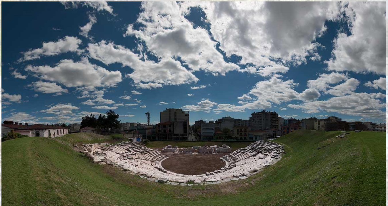
1 st Ancient Theatre of Larissa, Greece, 300 BC

Physiatrist, SFEBPRM - Pain Specialist, EDPM Dept. of Clinical Sciences Karolinska Institutet, Dept. of Rehabilitation Medicine, Danderyd University Hospital, Stockholm, Sweden